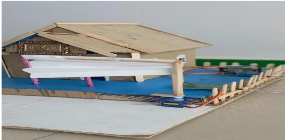
Figure. 5.1: Structure of a model

Fig. 5.1 illustrates the comprehensive structure of the model. It serves as a visual representation of the model's architecture and relationships between its various parts.