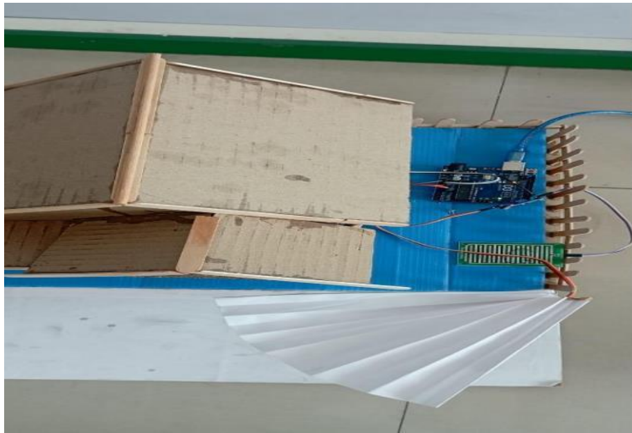
Figure. 5.3: Model with shutter close

servo motor, and Arduino board, allowing for effective automation of the sheltering system.