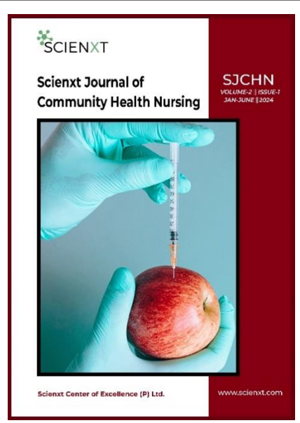
Scienxt Journal of Community Health Nursing Volume-2 || Issue-1 || Jan-June || Year-2024 || pp. 13-24