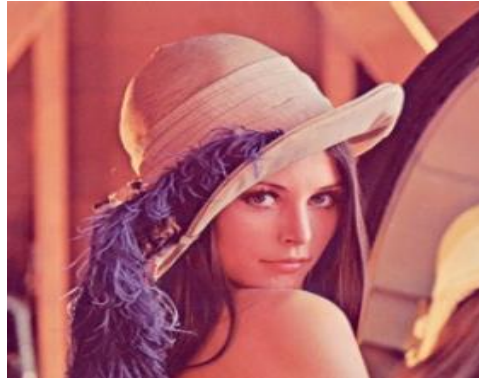
Figure. 1: Experimental Image (Lena.Png)